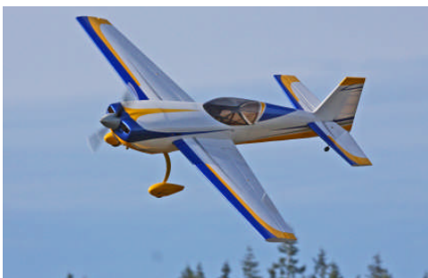
Plane of the Month